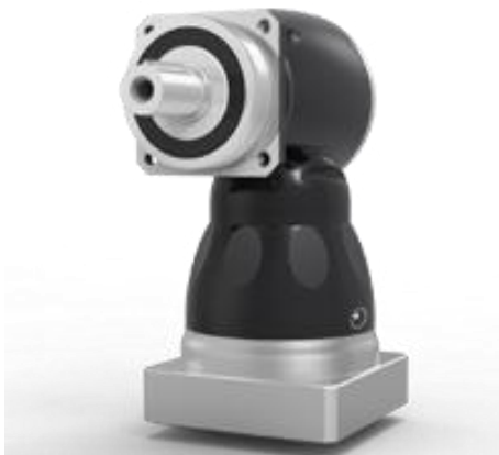
KF S1 / S2